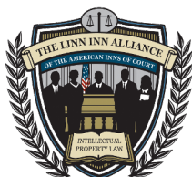
Eiichiro Kubota Not Photographed Tokyo Intellectual Property Inn of Court